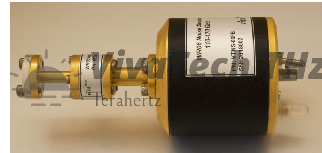
Figure 1. 110-170 GHz Noise Source with Isolator